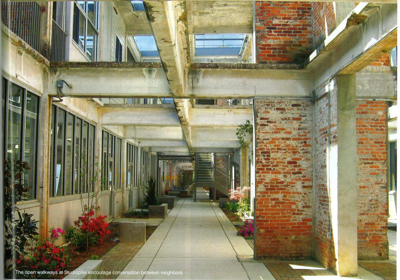
The open walkways at Studioplex encourage conversation between neighbors.